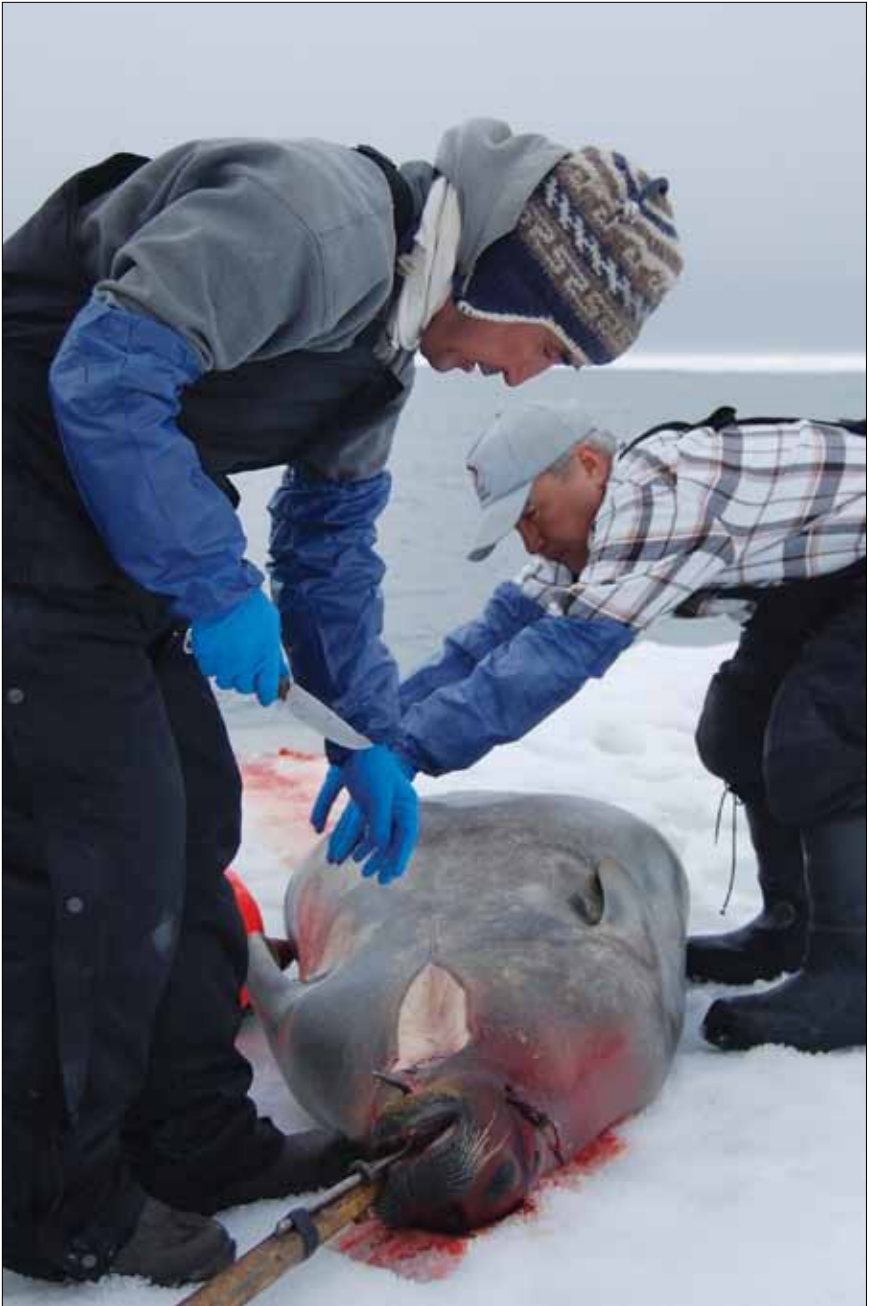
Butchering a bearded seal on the ice.