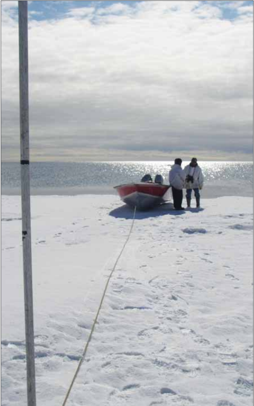
Taking a coffee break.