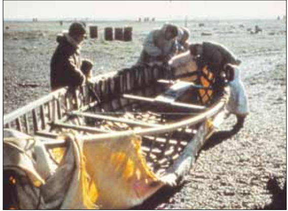
Maintaining a skin boat for seal and walrus hunting.

hunter exists in a remarkable time period. Our grandparents, just a step back in time, were raised in the old ways of skin boats, oars and spears. At the doorstep of the transition from ancestral ways to those influenced by western culture, today's elders have firsthand knowledge of the old ways.