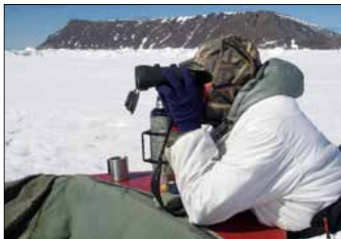
A thermos with coffee or tea can keep you warm while out hunting.