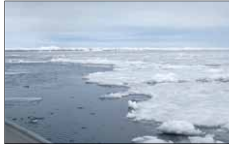
The young ice in the foreground is unsafe for people to walk on, although it may support a seal.

The ice looks good but you have to watch out. You can break through into the overflow.—Nicholas Lupsin, Saint Michael