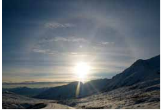
A sundog means a storm is coming.