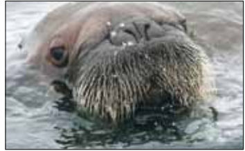
Walruses have very sensitive whiskers. If approached by an aggressive walrus, poke it in the whiskers.