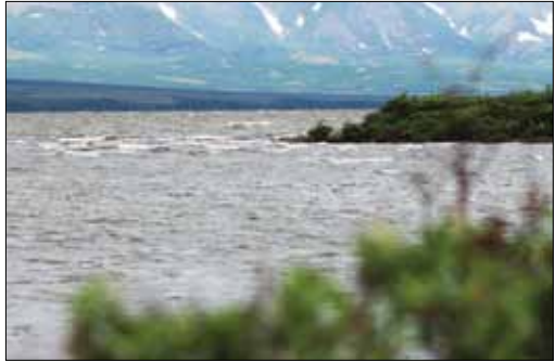
Wind blowing across open water will make dangerous waves.

The weather, as soon as it starts blowing, we head back towards the beach. When the ice starts floating out there towards the beach, floating in, a lot of times we get blocked out there, can't go anywhere. — Ralph J. Saccheus, Elim