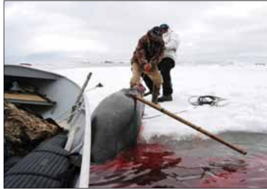
Bearded seals are very powerful. Make sure not to get tangled in the line. The death throes of a bearded seal while harpooned can still be powerful enough to injure.

Wait a few minutes to make sure the seal is dead. I know the ugruk, especially—it takes a long time for them to die.— Wallace Amaktoolik Jr., Elim