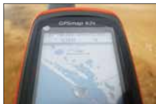
Bring a GPS and extra batteries.