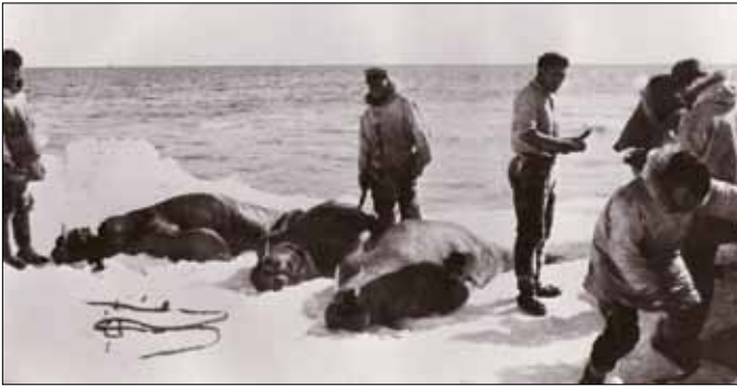
Before shooting a walrus or ugruk, make sure the ice is safe for butchering.

When you're approaching walrus, look at the condition of the ice they are on. The walrus is a lot heavier than us but the ice could easily flop over. I tell my crew not to shoot walrus that are on flimsy ice.— Bivers Gologergen, Nome