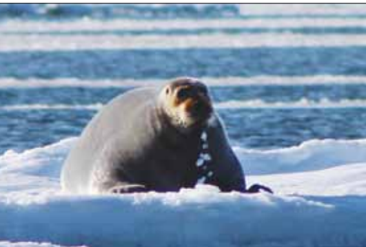
Bearded seals are large, powerful animals and hunters should be cautious.