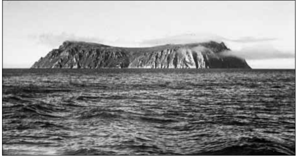
A cloud cap over Diomedede indicates that wind is coming.

Besboro Island gets a cloud on top if it's going to become real windy. Those elders really knew about the weather through the sky or some