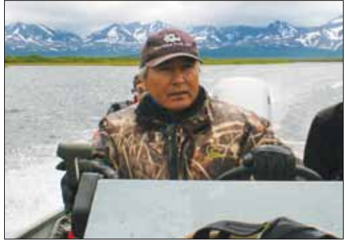
Always wear a float coat or other personal flotation device when boating.