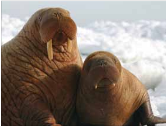
Walrus cows with calves are very dangerous because they will aggressively protect their young.

I've seen mothers panic and leave their calf on the ice. They get a little aggressive. You take your oar and push the calf in the water so the mother can find it and then you move on.