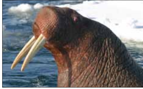
Young bull walrus with short tusks can be bold and aggressive.