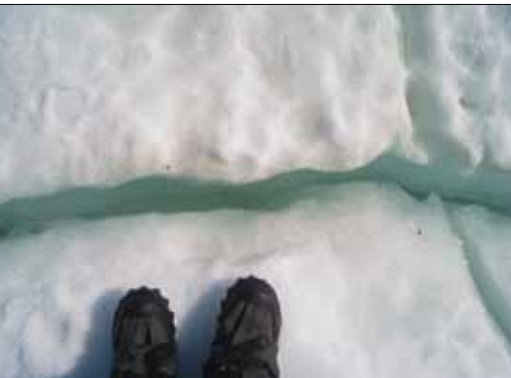
Pay attention to cracks in the shorefast ice. Don't park your snowmachine on the ocean side of a large crack.