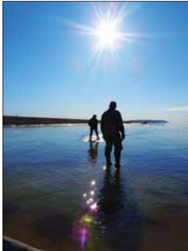
Testing the ice.