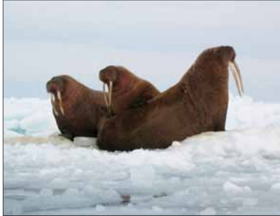
Hunting walrus can be dangerous.

By reading a marine mammal's body language or noises, a hunter can recognize aggressive behavior. An aggressive mammal is dangerous and must be avoided. Large groups of walrus are also dangerous. If attacked by a walrus, a hunter can poke it in the whiskers or shoot into the water.