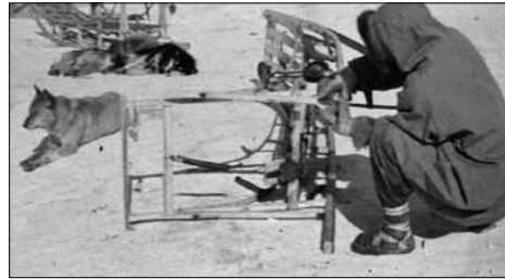
Maintain your gear so that it is in good condition when you are out hunting or travelling.

We wear adequate hunting clothing and have rain gear on hand, even when we are stepping out for a second.—Savoonga Elders Focus Group