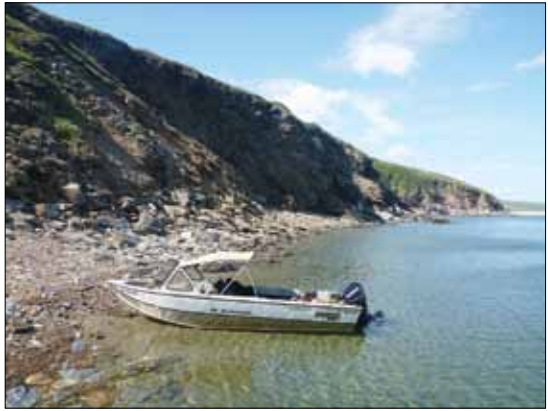
Sheltered area near Topkok. Know where to find shelter in case the water gets rough.

I've always taught to hug the coast as far as you could