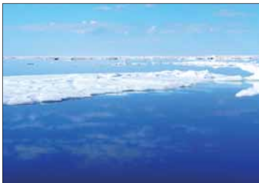
Try to hunt in good weather!

Hunters should check the weather before going out and stay observant while hunting. A hunter has many ways to read the sky