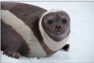
Ribbon seal.

A hunter must be aware and observant of their surroundings at all times, as carnivorous walrus can sneak up on boats. Good