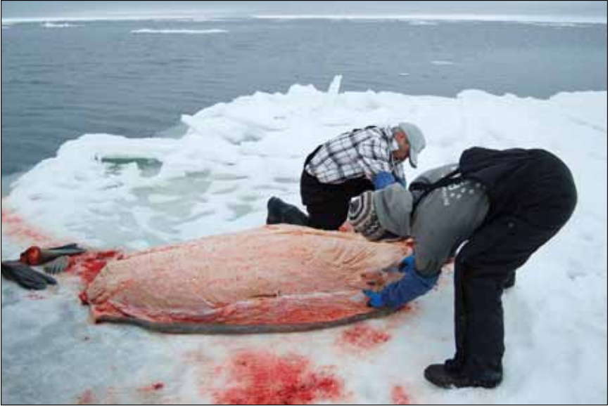
When butchering on the ice, keep an eye on currents and weather conditions.