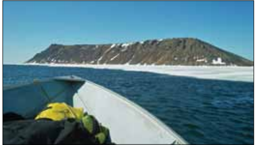
Boat along the ice edge, where swells are not as bad as in open water.

I was taught to hug the ice and stay with the ice for safety. The water (swells) are not as bad as the open water, so just follow the ice back and it will you get close to the land.— Bivers Gologergen, Nome