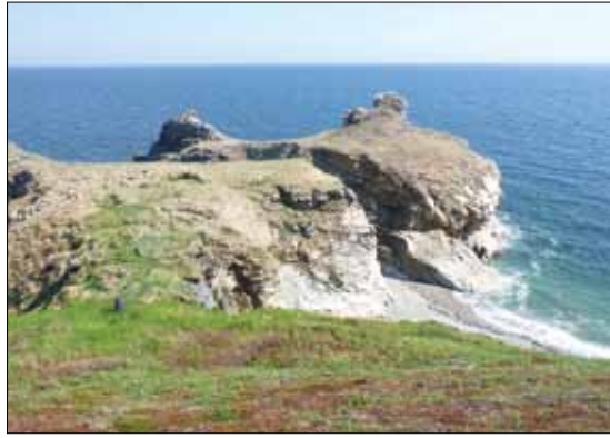
Be aware that capes and points often have strong currents.