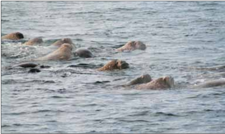
Large groups of walrus in the water can be dangerous.

When there's a large herd of swimmers we've been told to leave them alone. We don't go near them because they can poke a hole in your boat.—Joseph Kunnuk, King Island