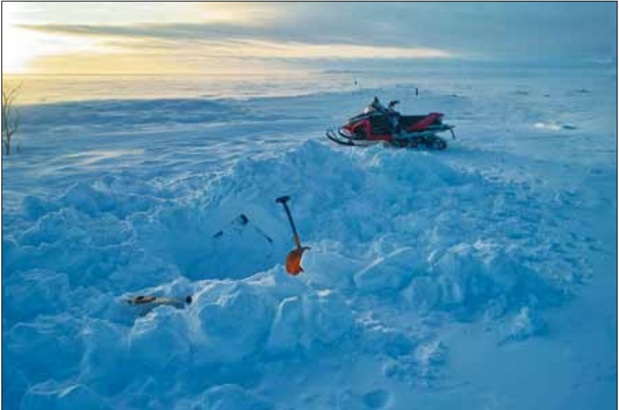
With a shovel and a saw you can build a snow shelter in an emergency.