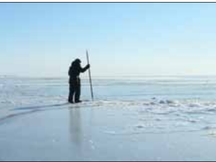
Always bring a walking stick.

Black ice is real thin—it's dangerous. If it's white, it's safe to walk on. If it starts to turn gray, it's marginal.—Sheldon Nagaruk, Elim