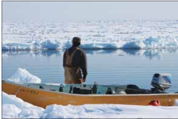
You can pull your boat up on the ice if the ice is closing in. Make sure the ice is safe.

The ice moves in and out—you have got to pay attention to where you're going in the ice. What the current will do with the ice, a lot of it depends on the weather and the wind.— Stan Piscoya, Nome