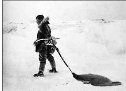
Bringing home a seal. (Photo: P28-170, Alaska State Library, Lomen Brothers Photograph Collection)

Today, the introduction of new technology and modern equipment has changed some aspects of subsistence. Aluminum boats, outboard motors and rifles are a few major examples. Today's