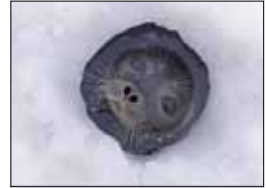
Beware of stepping into seal breathing holes.

We try to tell them to use a walking stick. There's a couple boys that stepped into seal holes and have had to be pulled out. If the snow is thick and deep and the hole is way down here, it's pretty hard to reach those guys that are in the water.—Sheldon Nagaruk, Elim